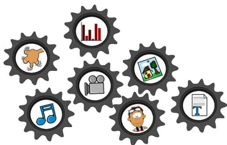
Figure 1 Assets: The cogs

At the start of the journey the project team found in some cases the "metaphor" of LEGO was used to explain underlying concepts of LOs (Long, 2006). In short small blocks of instruction (learning objects) could be clipped together to create a structured event (learning activity or sequence). You could, if you wanted re-use the small block in other structures. For example a map of New Zealand could be used as resource to indicate the physical relationships of a student's personal location with other towns or city's in New Zealand. The map itself could be re-used to indicate the location of rivers, streams and lakes or alternatively be used to describe geographical features such as wet lands, plains, hill country and mountains. These thoughts of re-use of discrete pieces of digital material appear to be based upon computer science object-orientated design (Downes, 2001) and because of this they had been labelled with the computer term of an asset.