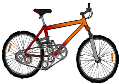
Figure 4: Learning Objects: The bicycle

From the OSFOR teams perspective it appeared confusion resulted if only one discipline was used as the basis for defining a learning object for educational purposes, a holistic approach is needed.