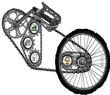
Figure 3: Information objects: The chain

However, are the digital collections created by the combination of two or more knowledge objects, the information object, a learning object? The team argued information objects should, indeed must, be linked with specific student outcomes for them to be useful. For example in the scenario described above there might be included student assessment activities designed for tutors and teachers to monitor and report on student progress against a specific learning objective. If knowledge objects are the links in the chain of learning objects information objects are the chains driving understanding (see Figure 3 on the left).